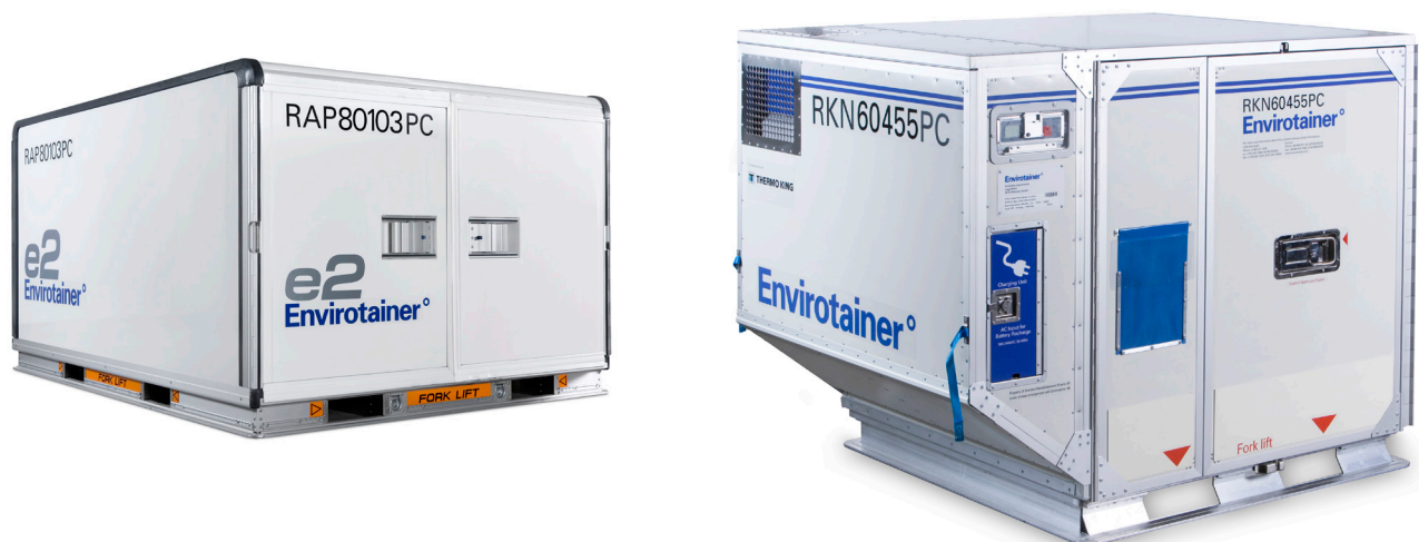
Figure 2. Envirotainer o active temperature-controlled containers (left: RAP e2, right: RKN).

As noted earlier, one of the biggest advances in the global air cargo industry in recent times has been the development and use of temperature control containers (Sales, 2013). Different versions of these containers are now available from the manufacturers, for example, C-Safe, a joint venture between AmSafe and AcuTemp of the United States or Sweden-based Envirotainer o (Figure 2) (Putzger, 2012).